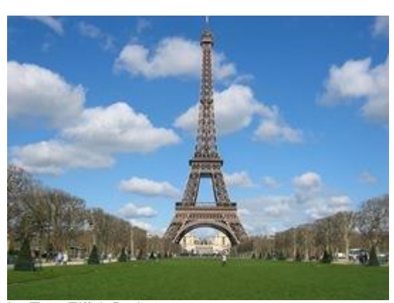
La Tour Eiffel, Paris

The University has signed several dual degree agreements with partner institutions including ESIC in Madrid, ISC in Paris and ISCAE in Casablanca. ESIC is one of the leading private business schools in Spain and has 6 campuses including Madrid, Valencia, and Sevilla. Paris School of Management ISC is a business school in the French "Grandes Ecoles" system. ISCAE was founded in 1971 in Casablanca and is considered as one of the leading business schools in North Africa.